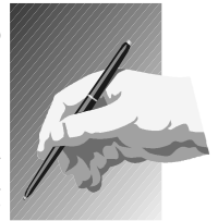
FROM THE DESK OF THE PRESIDENT

Second , The Authority of the Resurrection has its source specifically in the atoning work of Jesus. The resurrected Christ announces to His disciples; All authority has been given to Me in heaven and on earth, go therefore and make disciples of all nations . . . (Matt. 28:18-19). Paul says that if Christ has not risen from the dead, our preaching and faith are empty and we are of all men most pitiable (I Cor. 15:17-19). Jesus, responding to Martha, announces: I am the resurrection and the life. He who believes in Me, though he may die, he shall live. And whoever lives and believes in Me shall never die (John