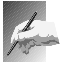
FROM THE DESK OF THE PRESIDENT

The passing of our annual graduation, June 11, 2006, officially launched Evangel Theological Seminary into its twenty-fifth anniversary year. It hardly seems possible that we have crossed the final threshold for the completion of a quarter-century of providing quality theological training and preparation to equip the people of God for ministry (Eph. 4:11-12). We thank and praise the Lord for His abounding grace and mercy these past twenty-four years that gave us strength to persevere in the midst of difficulties, discouragement and the spiritual warfare going on around us. We thank Him for His faithfulness in seemingly impossible situations and His magnificent provision for every need according to the promise in His Word (Phil. 4:19). We thank the Holy Spirit for frequently showing up and manifesting His power and revelation to us in extraordinary ways that erased any doubt of God's presence in our midst.