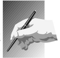
FROM THE DESK OF THE PRESIDENT

We are rapidly approaching the Easter season when Christians everywhere focus on the all important Resurrection of Jesus. In that regard, I want us to consider briefly a part of Luke's account of that victorious event (Luke 24:1-8). On the first day of the week, a group of women had come to the tomb of Jesus very early in the morning with their spices and fragrant oils to prepare the body for its official burial. They found the entrance stone rolled away and upon entering into the tomb, they discovered that Jesus' body was missing (vs.1-3). In the midst of their perplexity, suddenly two men appeared (Angels) standing by them in shining garments who simply asked, why do you seek the living among the dead (v.5)?